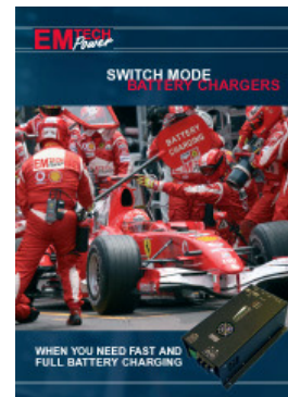
Switch Mode Battery Charging