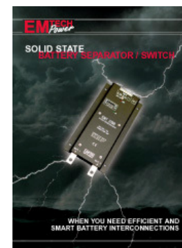
Solid State Battery Separator / Switch